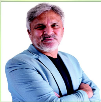
Moin Khan Former Captain PCT

Al-Hamdulillah, I am now pleased to announce Dua Green City Phase-II. I have no doubt that these nature-friendly farmhouses will redefine the contours of modern living in Karachi. Realizing the taxing and congested city life, we, at Dua Green City Phase-II have designed impeccable farm houses amidst lush green topography. We hope we can play a part in enhancing the standard of living of Karachiites.